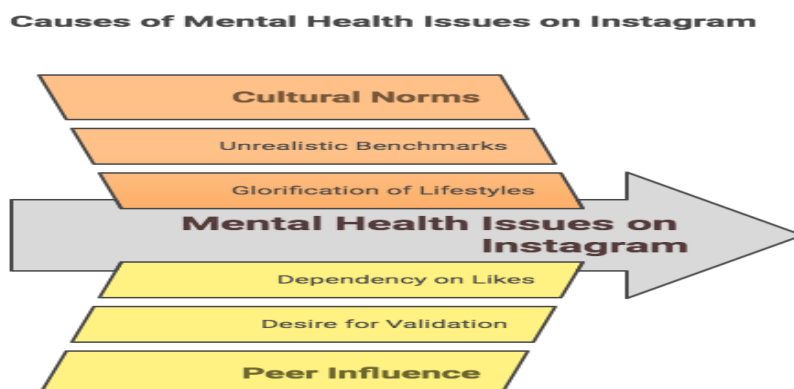
Figure 2. Causes of Mental Health Issues on Instagram (source: Data processed by Researchers)