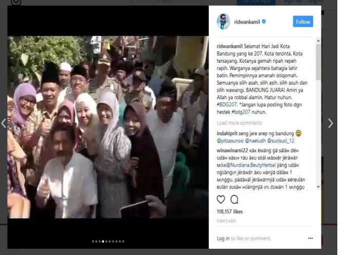
Figure 2. Ridwan's September 25 Post on Bandung Anniversary and Happy Residents Susilo Bambang Yudhoyono's Tweets

SBY tweets are selected from 7 August to 21 September 2017 amounting 19 tweets. Twitter posts are usually called tweets, which initially consist of only 140 letters, so users often send several tweets at once to discuss about something, including SBY who often sends some tweets to express his opinion on certain issues, including government policies. SBY's tweets mostly contain photos and a collection of photos with captions, as well as mere texts. SBY's photo tweets usually show SBY's activities as his position as former president and leader of Partai Demokrat party such as attending discussion forums and TV interviews. Some pictures also show personal activities such as cycling in the park. Two photos show SBY sitting as seen from the back right while writing with books on his desk. Both images have natural background, being located at the middle of lawn. In both photos some texts are embedded. In another post, there's a Youtube link with caption about a song created by SBY sung by two senior singers Harvey Malaiholo and Rafika Duri. On Indonesian independence greeting, SBY posted a photo of red and white flag with embedded text on the picture; "Todays' PATRIOTISM and NATIONALISM are the ones that make Indonesia DEVELOPED, PROSPEROUS, and MORE DIGNIFIED in the 21st century." The capital letters show emphasis on those words. Some other texts also use capital letters as an emphasis such