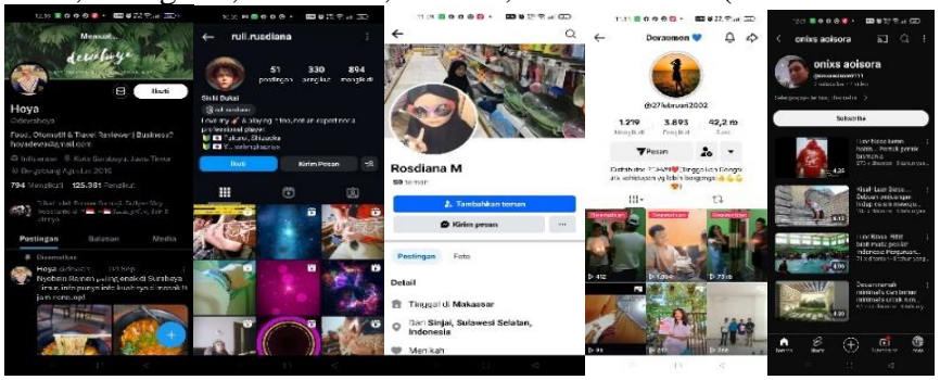
Figure 3. Some Examples of Mixture Social Media Accounts. Left to right, account in Platform X, Instagram, Facebook, TikTok, and YouTube Media Sosial X

Initially, social media platform X was limited to sending short messages and was classified as a microblogging platform. However, since 2023, X has introduced features for sharing photos and videos, participating in discussions, and live broadcasting. These updates have made X's functionality similar to other social media platforms, allowing users to share text, photos, and videos, as well as participate in online discussions and live streaming. Platform X categorizes accounts into two types: free and paid. Free accounts can only post messages up to 280 characters, including spaces and punctuation. However, users can post up to 25.000 characters and upload videos up to 3 hours long with a premium subscription. Paid accounts are divided into three tiers: blue check, gold check, and grey check. The blue check is available for a subscription fee of $8 per month, the gold check for $1.000 per month, and the grey check is reserved for government and official institution accounts (Putri & Kurniawan, 2022). As a result of paid verification, fake accounts on platform X can also acquire blue and gold checks as verification marks (Media Indonesia, 2024).