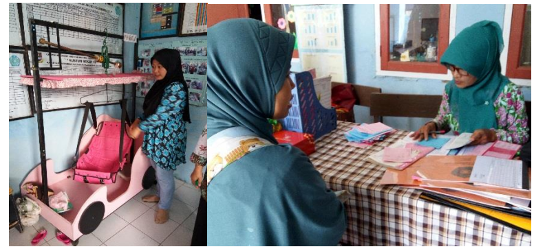
Figure 1. Weighing, High Measurement and Recording Processes

Posyandu function as spearhead in providing maternal and child health services includes 5 functions of services, i.e monitoring, growth, nutrition and health education, immunization, family planning services and basic health services. Empirical experiences in some places indicate that the primary health care community strategy with the focus on mother and children can be done in every Posyandu. Posyandu can perform basic functions as children growth monitoring unit, as well as delivering message to the mother as renewal agent and family members who have babies and toddlers to find ways to keep children well, which supports the growth and development of the children.