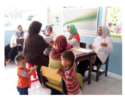
Figure 2. Toddlers' Growing Consultation

Posyandu in West Bandung regency had 4 times in succession won the champion as the best posyandu in West Java and National Level (http://www.bandungbaratkab.go.id/content/posyandu-kbb-terbaik-di-jawa-barat). The assessment criteria are administrative neatness, observation of posyandu opening day service, and cadre capability tests and jury will also investigate the participation of the community on the outcomes of posyandu activities on public opinion about posyandu.