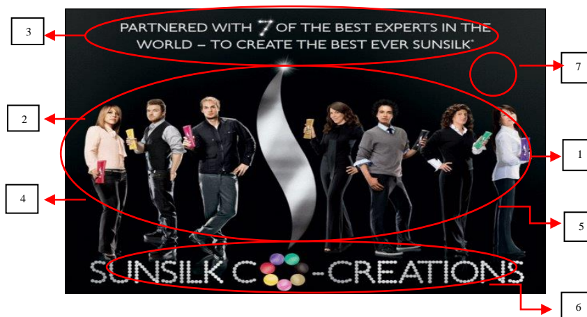
Image 2. Symbol of Sunsilk Co-creations Print Advertising (Sunsilk, 2016)