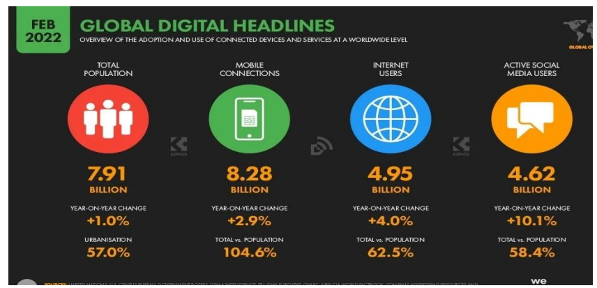
Figure 1. Smartphone, social media and internet users in February 2022 (Wearesocial.com, 2022)

From Figure 1, it is shown that there were 160 million active social media users as of February 2022. This data increased by 12 million from 2021, which recorded 150 million active social media users. Furthermore, in Indonesia, the most widely used social media are YouTube, WhatsApp, Facebook, Instagram and Facebook Messenger.