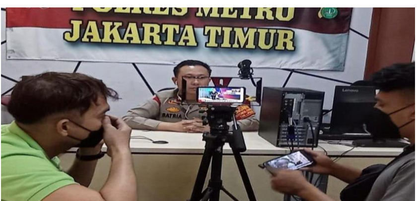
Figure 3. Journalist coverage content using a smartphone