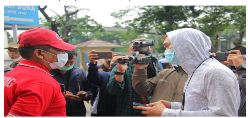
Figure 4. Journalist coverage using a smartphone & handycam

The existence of this monetization feature is what finally differentiates the meaning between YouTubers and content creators, the difference in this mention is because YouTubers allegedly have an interest in monetizing each video content produced. The results of Ruiz-Gomez et al., (2022) regarding the commodification of society in the networking era, show that content creators use YouTube to utilize