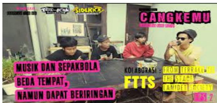
Figure 1. This image displays a screenshot from a podcast or talk show event entitled Cangkemu (your mouth). The topic of discussion was Musik Dan Sepakbola Beda Tempat, Namun Dapat Beriringan (Music and Football: Distinct Domains, Yet Capable of Coexistence) (source: the collaboration between From Terrace to The Stage (FTTS) and the Lamidet Society)

We move our discussion to Rumah Api's activism (see in Figure 2). We observed that Rumah Api's activism as an effort to produce alternative space of the city. According to (Martin-Iverson, 2020), punkers' hangouts have been important sites for urban, working class, and young people's sociality and place-making which differentiate them from the mainstream. Punk scenes establish spaces, such as performance venues, studios, distros, shop houses, galleries, art spaces, community organizing, or activist spaces of various kinds. They produce their own space, specifically an autonomous one, to run collective decision-making and social place which can be connected to as a form of protest and as an alternative to life away from capitalism. In addition, it is not subject to intervention from the state and economic pressure. Thus, the struggle to defend the space is important because it determines whether the punk community will be independent or otherwise (O'Connor, 2008). In Malaysia, several spaces are often associated with titles such as punk community, underground, alternative, or DIY. One of which is Rumah Api (Ampang, Kuala Lumpur).