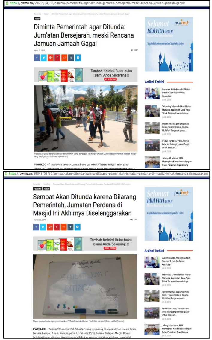
Picture 2. The News which the Titles have been rectified by the Editors of pwmu.co.

Generally, news that is read continuously is a religious topic, such as news that tells the rules of praying with the Indonesian language, Muslim converting story, or 'Fiqh'. On the other hand, news that always is the top trending in a specific time is the rules regarding uttering Christmas to Christians' friends and of 'Syaban' fasting.