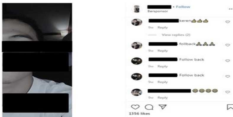
Figure 3. Informant's expression on Instagram