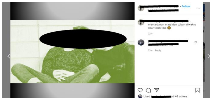
Figure 5. Close Relationship in Instagram

(source: screen capture of the informant on his Instagram account, initial DD)