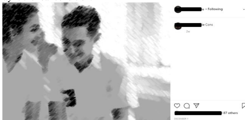
Figure 6. Informant with his Girlfriend