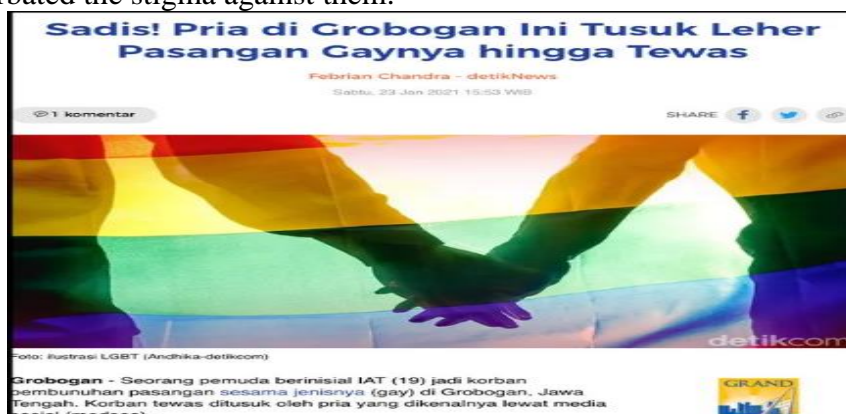
Figure 2. Gay News in the Media

Indonesia has no national law that prohibits homosexuality, except for Undang-Undang No. 1/1974 concerning marriage. This law stipulates that legal marriages are only marriages between heterosexual couples, but wider discrimination occurs in the LGBT (Lesbian, Gay, Bisexual, and Transgender) community. In the last five years, discrimination against gender and sexual minorities in Indonesia has increased. Non-governmental organizations that focus on advocacy for LGBT rights have recorded various acts of discrimination, ranging from bullying to murder. The media in Indonesia has an important role in creating stigma against the LGBT community. Anti-Gay media prejudice can be seen from the news headlines, news point of view, word choice, and the selection of their sources. This marginalization and stigma causes the gay community in Indonesia to avoid appearing in public spaces and media (Azhari et al., 2019). It was found that the gay community in Indonesia used social media to change stigma. Until now, Indonesian people continue to label homosexuality as deviant sexual behavior. Through social media, the gay community tries to fight this labeling by avoiding extreme expressions of sexuality. Through social media, the gay community denounced actions that exacerbated the stigma against them.