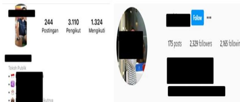
Figure 4. Number of Followers on Instagram

Instagram. These friends can come from various regions in Indonesia and even from abroad (informant DD).