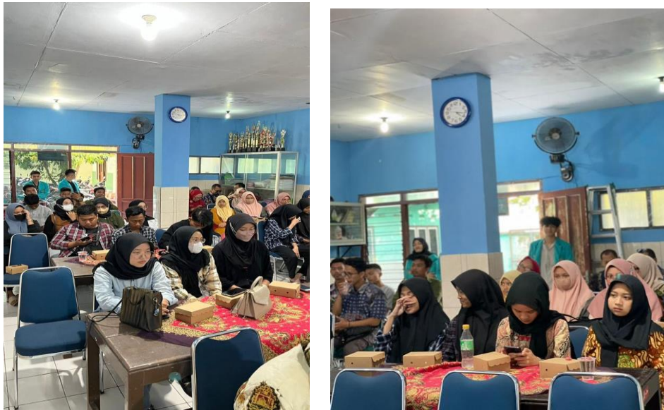
Figure 2. The Organization of the Legal Socialization Activity

and Welfare) Room in Hall Office of Paulan Village, Colomadu District, Karanganyar Regency.