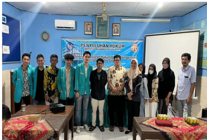
Figure 4. Amicable Session between the Speakers and the Committee

The legal socialization that was organized in the Hall Office of Paulan Village, Colomadu District, Karanganyar Regency is hoped to be useful for society in increasing their knowledge and awareness on utilizing social media in good and correct manners. This is so that they can directly apply the knowledge when utilizing the Internet and social media. They also need to increase their spirit to always comply with the applicable regulations. It is hoped that they are careful in spreading information so that they do not create or spread hoaxes that will bring harm to many parties. Apart from that, it is also hoped that they may become more careful in keeping their privacy/personal data to prevent from having their data misused by irresponsible parties (Tobing & Fitriana, 2022).