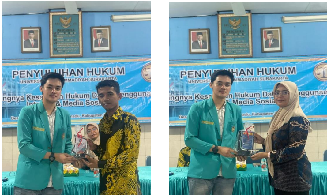
Figure 3. The Presentation of Souvenirs to Speakers