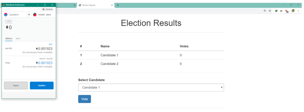
Your Account: 0xc0ac490601d35ce0c83bc067d7a57ec3568068cd

3. After pressing the vote button, a new page will appear to confirm that the voter account will send a Gas Fee as a condition for voting. This transaction is a proof that the voting has been done and entered into the blockchain chain.