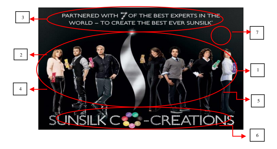
Image 2. Symbol of Sunsilk Co-creations Print Advertising (Sunsilk, 2016)